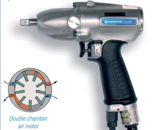
Double chamber air motor