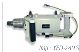
Img.: YED-240 S

The TKa series can optionally be supplied with green/red LEDs instead of the acoustic signal transmitter (ref. small pictures on the right) – silent and visible all around: from above, below, left, right, front, rear.