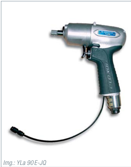
Img.: YLa 90E-JQ