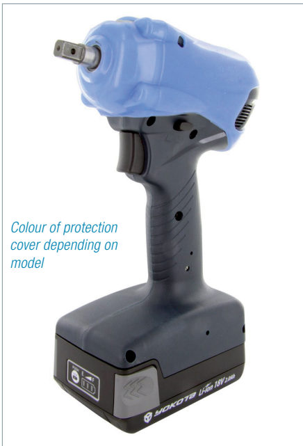
Colour of protection cover depending on model

Yokota YZ-NP battery impulse wrenches are powerful, very accurate and most important, have no kick-back. The very compact design offers great accessibility to the joint.