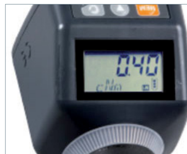
LED indicator guides user towards target torque and warns of over torque in tightening mode.